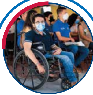
Vulnerable Population Groups